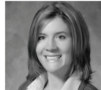
Megan Michael Family Law