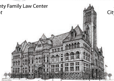
Allegheny County Courthouse