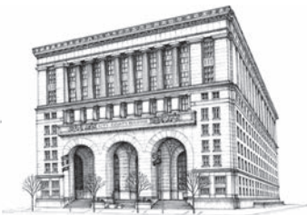
Allegheny County City-County Building 18 x 24 inch print