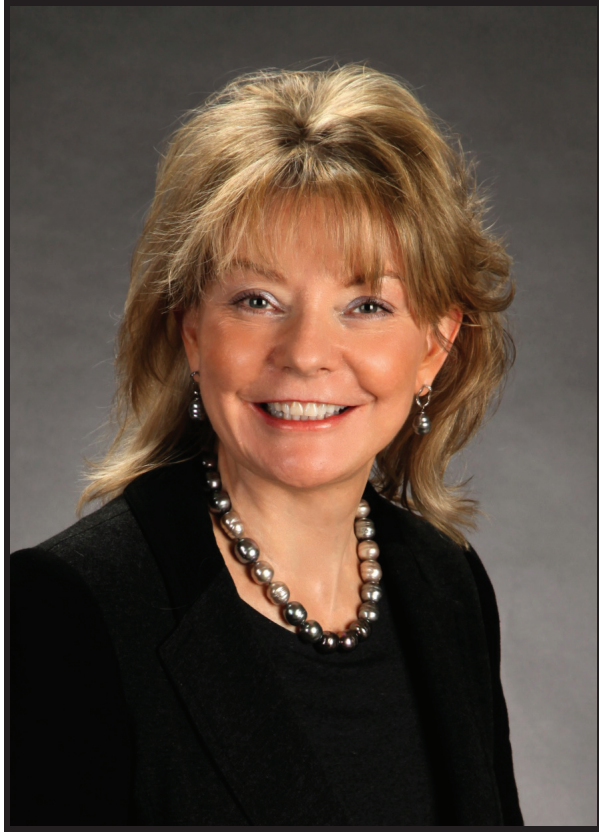
Hon. Christine Donohue